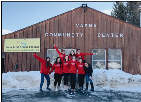
A cheerful group of Ithaca College students visited Varna in January for an MLK Day of Service. Among other projects, they painted a wall and prepped a mailing. So helpful!

Non Profit Org US POSTAGE PAID Ithaca, NY 14850 Permit #312