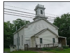
Varna Church 965 Dryden Rd. Worship service: Sundays at 11am

Our next chicken BBQ is AUGUST 5 . Dinners of a chicken half, salt potatoes, baked beans, roll and dessert are $10. Chicken halves will be $8. Please join us!