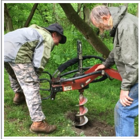
May 2017: Volunteers drill post holes for the new fence around the Varna Community Playground. In the rain. Of course.

Non Profit Org US POSTAGE PAID Ithaca, NY 14850 Permit #312